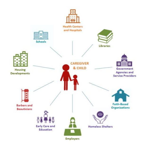
Figure 2: Boston Basics, 2018

worker along with the caregiver/s, and larger group discussions with program participants. 62 This model, however, limits scalability to every family at the neighborhood or city level due to costs.<sup>63</sup> The Boston Basics program offers another delivery model through "socioecological saturation" of target neighborhoods. The Basics program seeks to spread interaction and play techniques between caregivers and children (similar to other ECD programs) by saturating the target neighborhoods with messaging, training, and encouragement to engage each family and the whole community around them. Boston Basics works through a number of neighborhood, community, and city institutions, as depicted in the figure above. The goal is to achieve universal adoption of these practices in an entire neighborhood. There are a number of ways a similar campaign could be launched with the Sudanese, South Sudanese, and Somali communities in Ashr and Araba wa