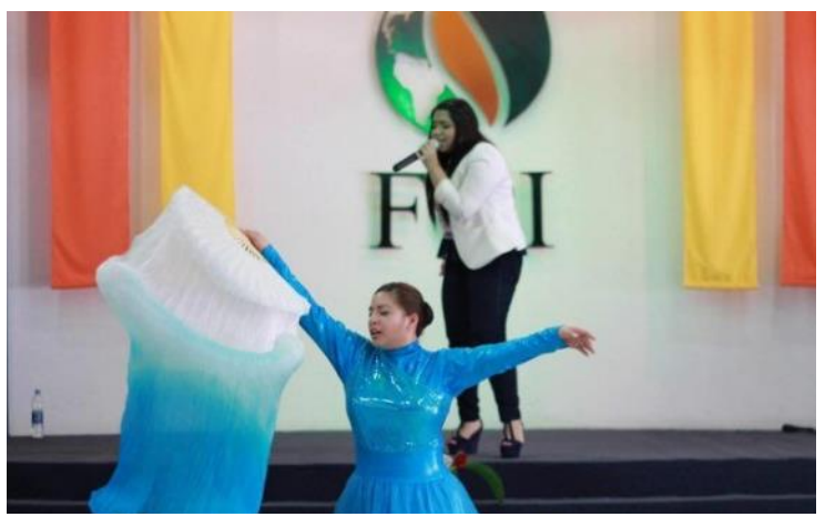
Figure 10: Dance group in the special service "Fiesta de Libertad".

Finally, churches organize events to celebrate immigrants. For example, the "Iglesia Intercontinental," which celebrates Fraternidad Cristiana Central America's independence in September, hosts a special service called "Fiesta de Libertad," where the different national anthems of Central America are presented, artistic presentations are made, and the typical cuisine of each country is shared. It is an exchange involving both locals and migrants that is rooted in acceptance, interest in learning from diversity, and a respect for each country's cultural richness. Churches are active participants in these celebrations. A pastor commented, "the church teaches a lot of respect and openness to know different cultures, not to close oneself." Further, in the Catholic Church, intensiones (prayers)<sup>22</sup> are made for migrants at masses throughout September, which is celebrated as the "Month of the Migrant."