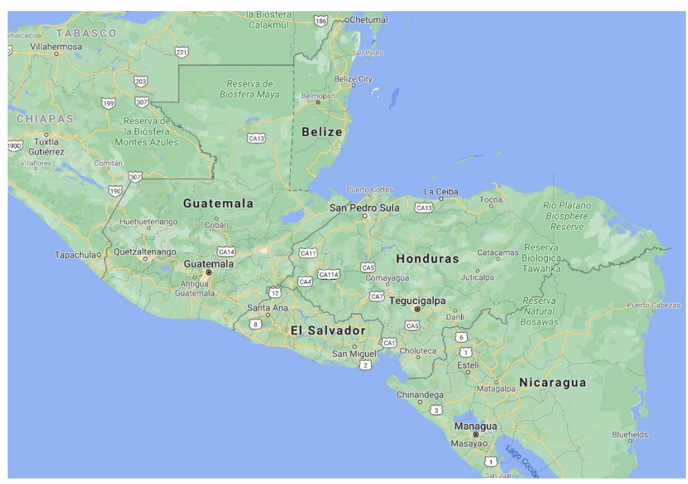
Figure 1. Map of Central America, American Continent.

"God, Union, Liberty"<sup>1</sup> is written on the white stripe representing peace and harmony on the national flag of the Republic of El Salvador. This emblem symbolizes the importance of faith and hope in the identity of the Salvadoran people. El Salvador has a population of around 6.6 million and is known as "The Thumb of America" for being the smallest country in Central America.<sup>2</sup> El Salvador is divided into 14 administrative departments, each with its own municipalities. It is a young democracy, and its economy recognized the U.S. dollar in 1999.