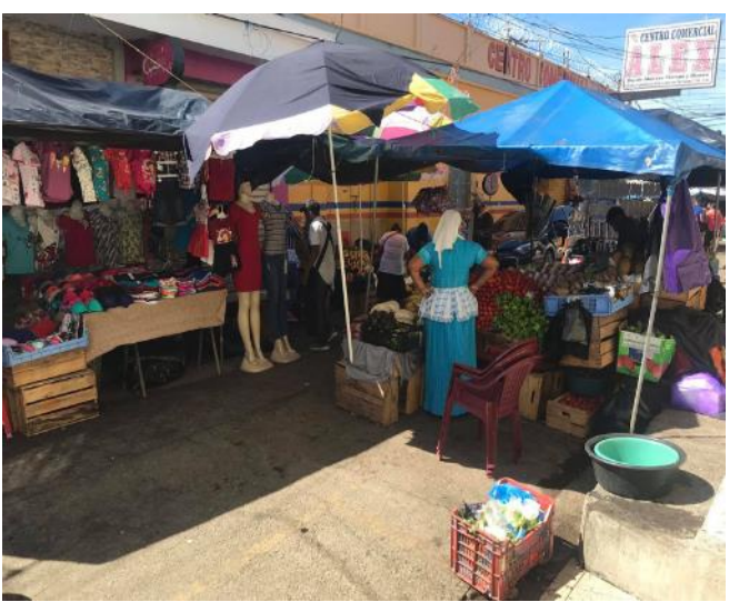
protectors, and other products.<sup>9</sup> It is hard to Figure 3: Trade of fruits and vegetables in the urban area—photo by author.

without dropping any fruit and sneak through the streets full of crowds of people and