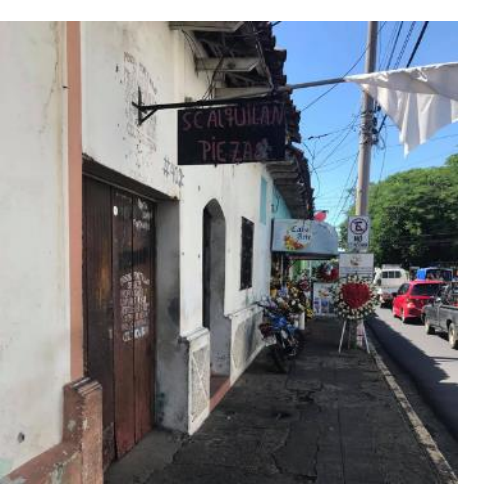
Figure 4: The white flag is used to request food supplies due to the lack of economic income resulting from the quarantine imposed by the COVID-19 virus

The mesones <sup>12</sup> are a place where mostly male migrants live in urban areas. They have a low cost but small space. When they do not have water service, residents buy water from pipas <sup>13</sup> or draw water from porras .<sup>14</sup> In contrast, Nicaraguan women who do domestic work live in their employers' homes with more comfort.<sup>15</sup> Those who work in rural areas sometimes live in adobe piezas <sup>16</sup> near the ranch. In the best-case scenario, they have a bed and light, but sometimes they only have a hammock. These small spaces are a health risk, not only due to the deficiencies of some services but also due to the high temperatures that can reach 36 Celsius (97 Fahrenheit).