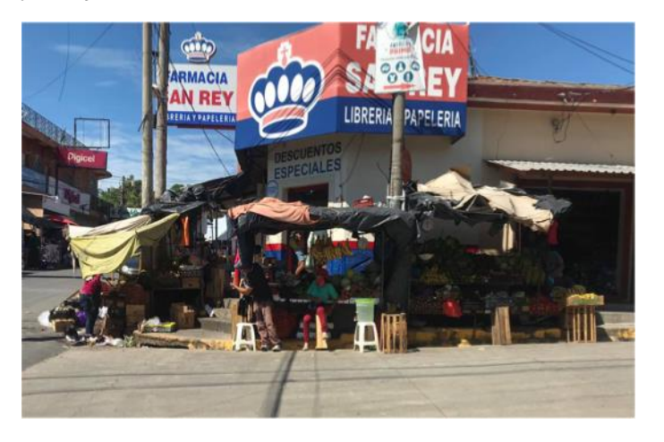
Figure 6: The sidewalks of businesses and branches of companies become sales of vegetables and fruits during the day and are removed at night so more people can earn a living