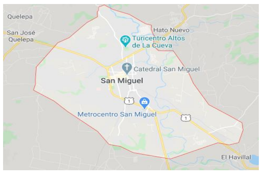
Figure 2: Map of San Miguel, El Salvador.

The city of San Miguel, population 218,410,<sup>3</sup> is the departmental capital of San Miguel in the eastern part of the country. San Miguel has the largest number of international fast food outlets and the only shopping center with a cinema in the whole eastern part of the country. Much of the economic activity in San Miguel is driven by its population of around 23,000 students.<sup>4</sup> Several private and public institutions provide health services, especially San Juan de Dios National Hospital, which is famous across the eastern part of El Salvador because it is one of the largest hospitals in the country. Finally, San Miguel is also known for its patron saint festivities which are carried out by the Catholic community throughout the year in honor of its patron "Our Lady of Peace."