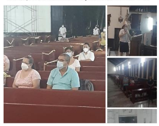
Figure 12: Screenshot of church Facebook Page in San Miguel.

Segunda Asamblea y la Santa Misa en la Parroquia Nuestra Señora de Guadalupe, San Miguel. Le correspondió al Sector # 5 y al Ministeri... Ver más