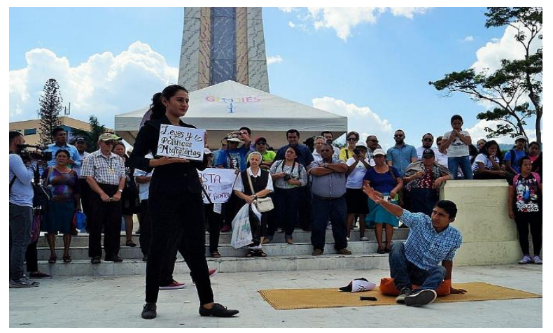
Figure 9: "Viacrusis Migrante 2018", carried out by Caritas El Salvador, in San Salvador, the capital of the country, on Saturday, March 24, 2018, under the slogan "From the dream of migrating to the nightmare of deportation."

At the end of year's church services, various members from the congregations are put in charge of sharing traditional dishes from their countries of origin—such as Nicaragua, Guatemala, and Honduras—with other church members. Although there are few migrants in the congregation, they are very active members and are brought to the congregations' attention through this cuisine-sharing activity.