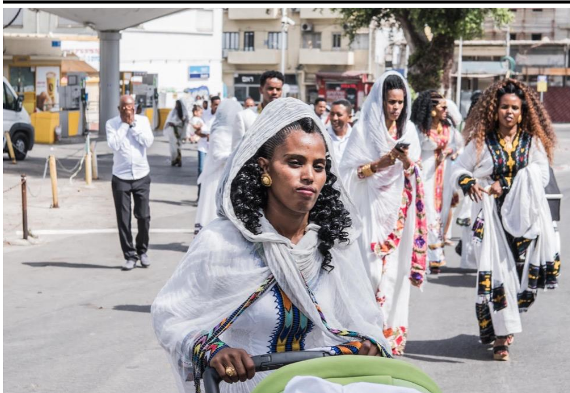
Figure 2: Eritreans in South Tel Aviv

Eritreans on their way to a park after a baptism ceremony in church. South Tel Aviv, 2018.