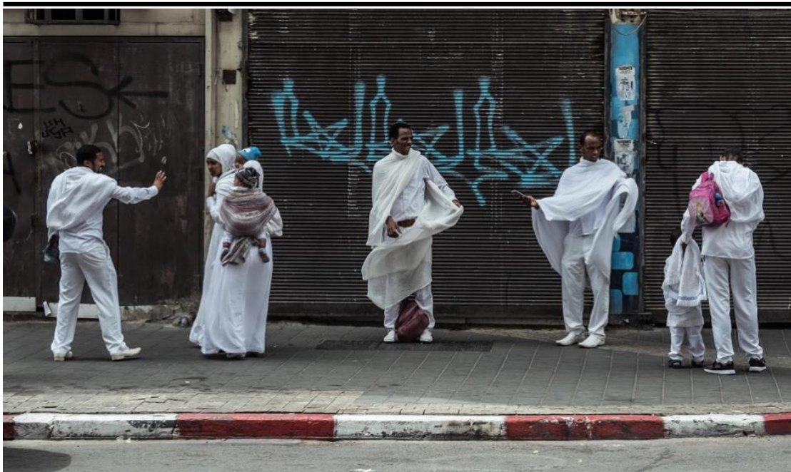
Figure 1: A South Tel Aviv Baptism

Eritreans on their way to a park after a baptism ceremony in church. South Tel Aviv, 2018.