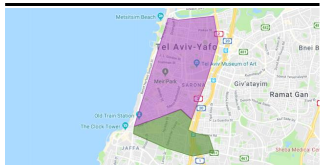
Map 1: Tel Aviv's Neighborhoods

North and Central Tel Aviv in purple, South Tel Aviv in green. This green area includes Levinsky Park and the central bus station, both of which are hubs for newly arrived and settled migrants. Map by authors. Base map imagery © Google 2019.