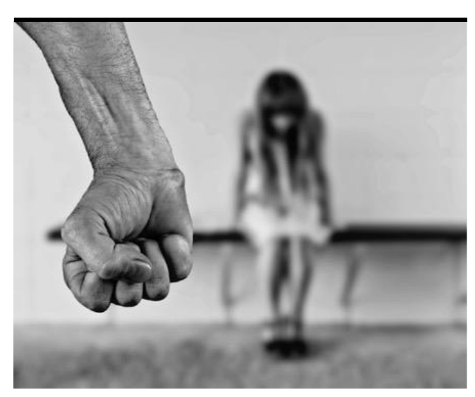
An image used in a domestic violence presentation.

behavior, in turn slowly changing their views in a positive way.