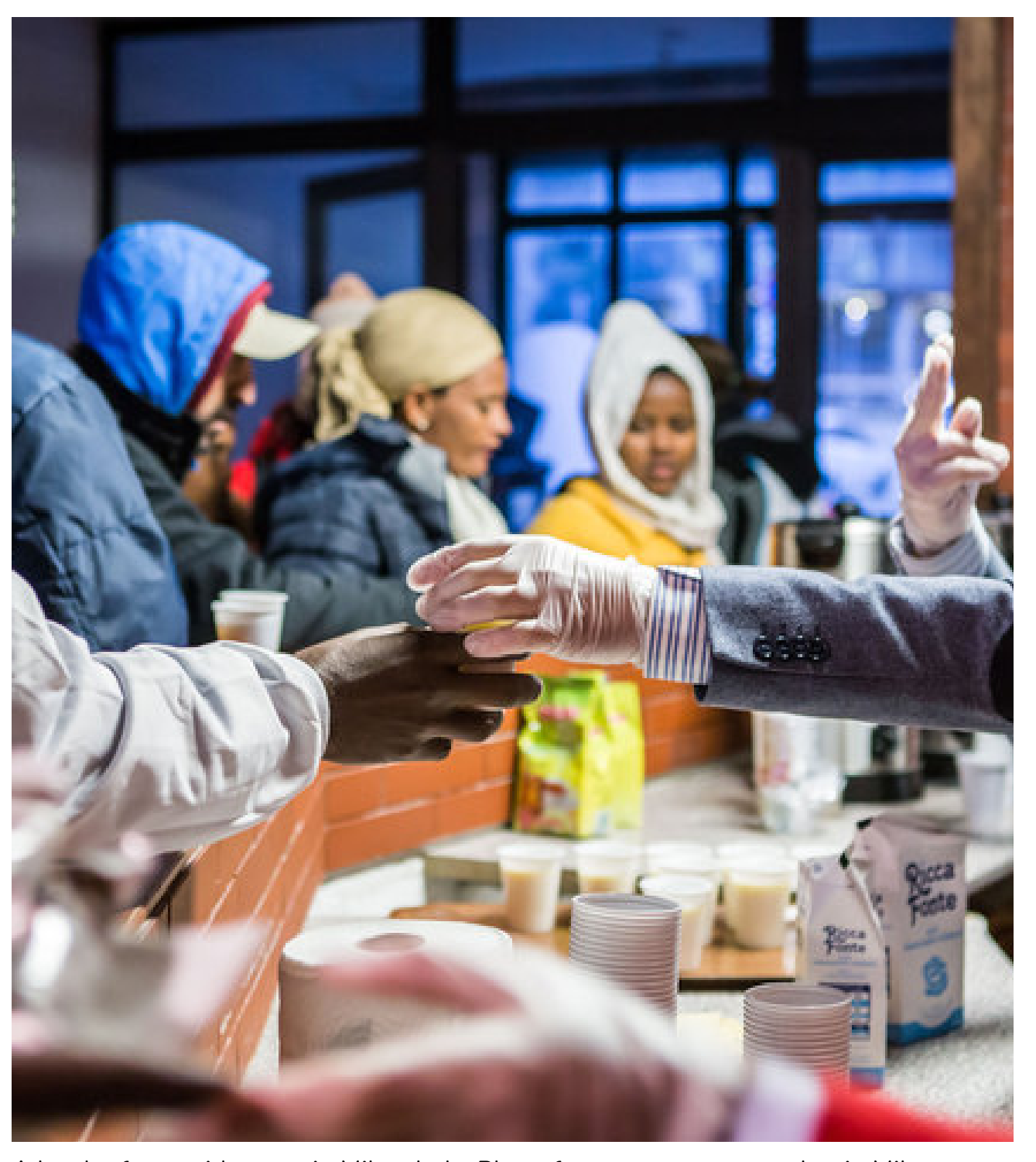
A local refugee aid center in Milan, Italy.