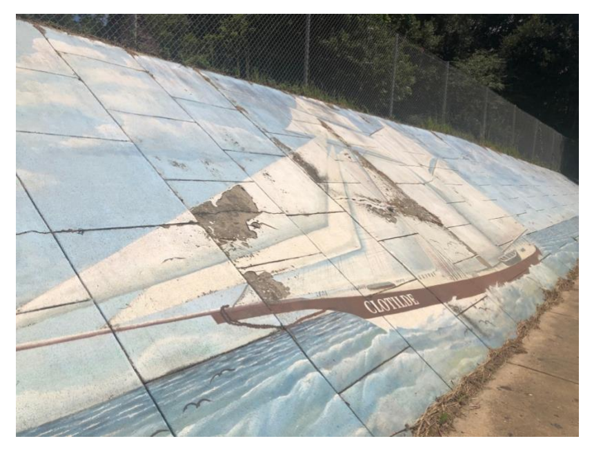
Photo 5: A mural commemorates The Clotilda in Africatown, Mobile.

responsibility to guarantee public education."<sup>16</sup> This law existed until 2022, when Alabamians voted to revise the state constitution and eliminate racist notations within the document.