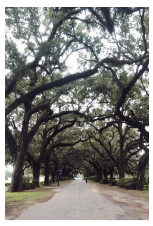
Photo 7: Avenue of the Oaks, Spring Hill College.

Geographical divides impact study responses. Though this study found relatively few correlations between resettlement location and racist experiences, further research will be helpful to assess broader resettlement experiences within the South. Several participants in Mobile noted the South's reputation as a hotbed for racism and intolerance, yet few participants expressed higher rates of mistreatment due to their geographic location. However, the urbanity of Mobile could have an impact on refugees' experiences. Studies in smaller Southern cities might very well yield different results; therefore, further evaluation of refugees' resettlement locations and corresponding integration experiences is required to accurately assess resettlement within the South.