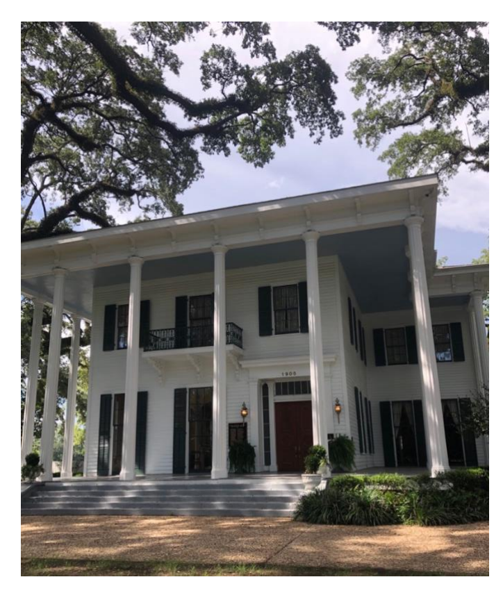
Photo 3: Enslaved laborers built the Bragg-Mitchell Mansion, an Antebellum landmark in Mobile. Mobile's history has shaped its present landscape.