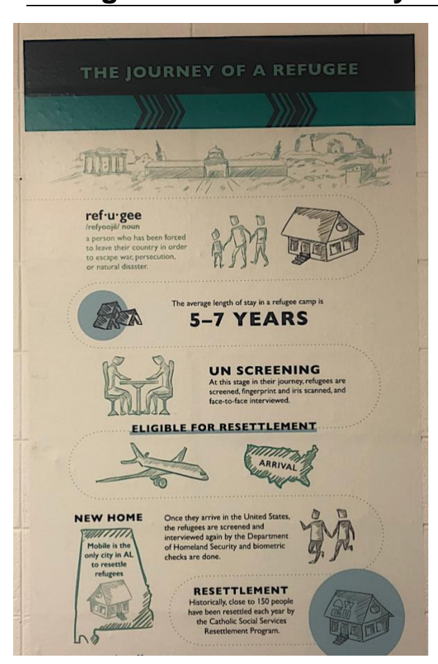
Photo 6: Informational posters at Dwell Mobile educate community members about refugees and their journeys to the US.

As the only post-resettlement service provider in the broader Mobile region, Dwell Mobile plays an extensive role in the lives of local refugees. In a state with broadly anti-immigration policies, Dwell Mobile has thrived and has garnered an extensive network of local community support. Such support speaks to many Mobilians' growing willingness and desire to work with refugees; government policies are not entirely indicative of public attitudes.