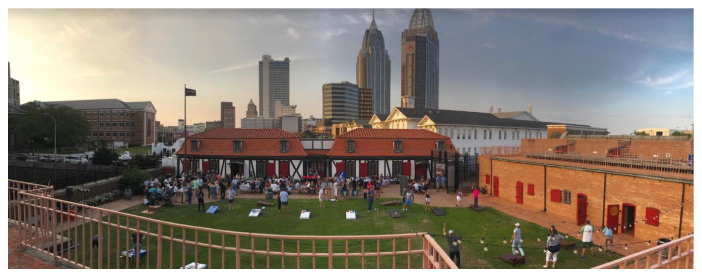
Photo 1: Dwell Mobile community fundraiser.