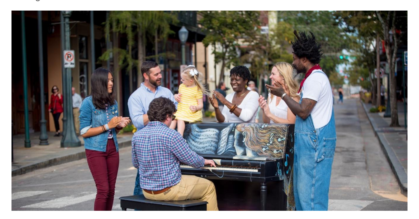
Photo 2: Mobile residents enjoy a piano performance. Like New Orleans, Mobile's early days as French settlement heavily influence its culture.

construction.<sup>11</sup> Immigrants primarily work within the healthcare and construction sectors. Mobile has an unemployment rate of 2.8%, nearly a full percentage point below the national average of 3.6%.<sup>12</sup>